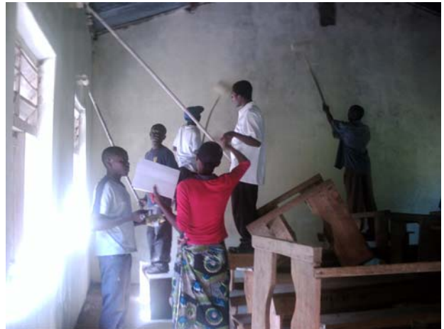
The students joined in the painting and everyone got some paint on themselves.